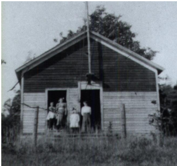
District 10 Nobles