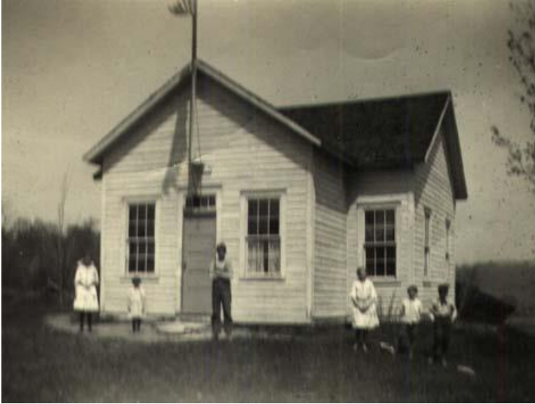
District 7 Woodard