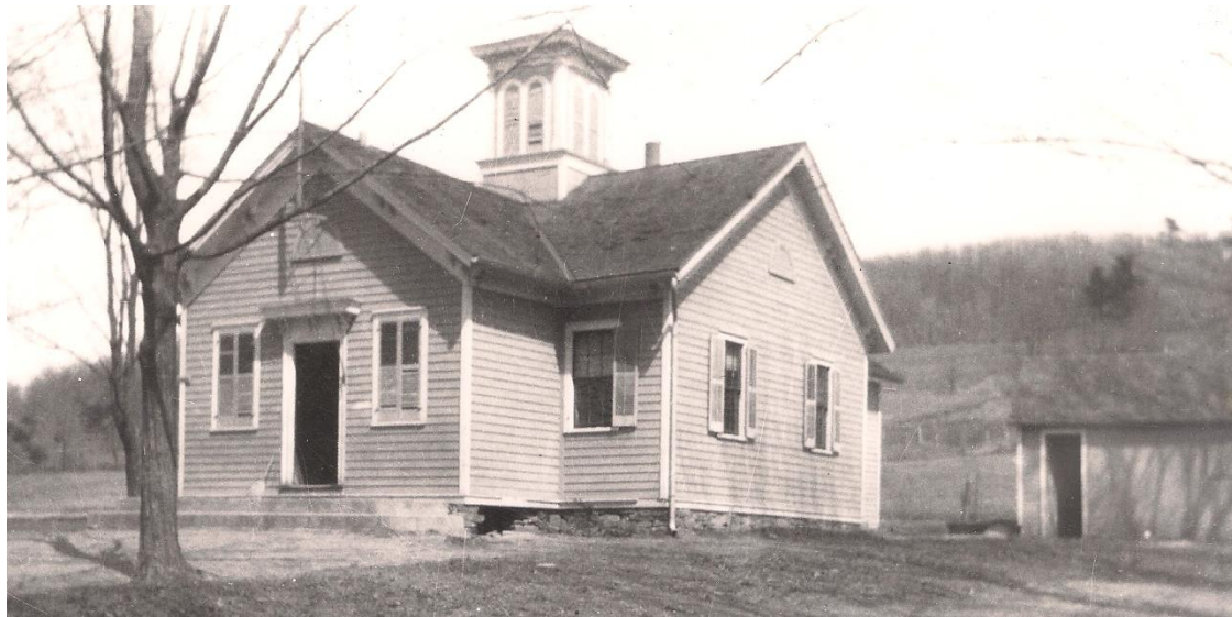
Enfield Center School