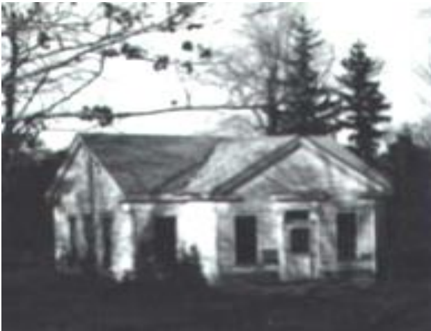
District 8 Purdy School