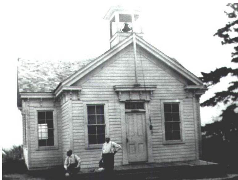
District 14 Budd School

DISTRICT #13 - (Christian Hill) located southeast corner of Waterburg and Iradell Roads. Annexed to District #1 Ulysses September 2, 1941.