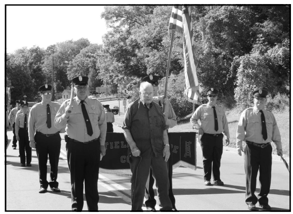
Leading Trumansburg parade in 2013