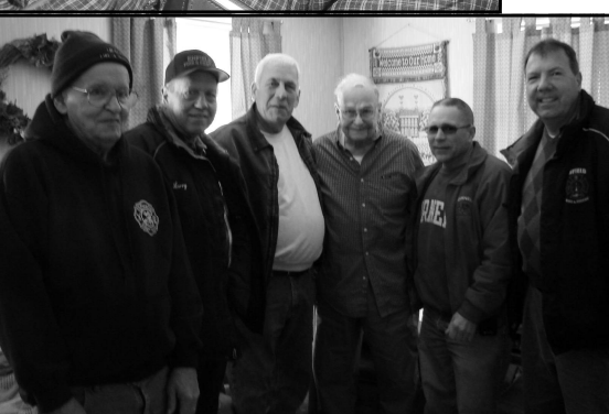
Celebrating 55 years of service