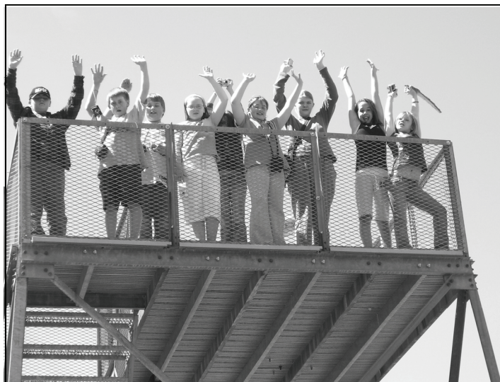
Enfield Youth with Danby Youth exploring Montezuma during April Break

This summer, Enfield programs will be centered at the Enfield Community Camp-- the CIT program (Counselors-In-Training), Primitive Pursuits , Photography and Crafts (to be sold at the Enfield Harvest Festival-- cultivating our budding artists and entrepreneurs!). There will also be a 3-day Backpacking program during the end of June, where participants will walk on the Fingerlakes Trail just west of Enfield and camp along the trail.