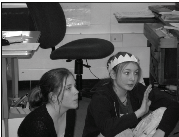
Youth Telling Their Stories in a Storytelling Program

Finally, at the end of the summer and at the beginning of the school year, Enfield Youth will be gearing up for the Enfield Harvest Festival. Our youth volunteer at events, help with games, create crafts to sell, cook food at the festival, and, most importantly, participate in this fun community event.